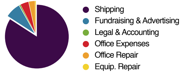
Breakdown of Expenses

Project V.E.T.S. had another stellar year of growth in 2011. As a result we ended our third year in a very strong position with retained cash and supplies adequate to ensure a strong start to 2012.